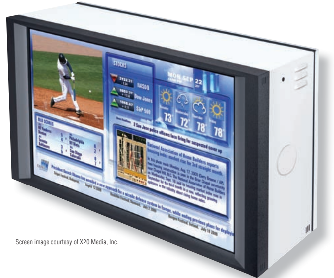
Screen image courtesy of X20 Media, Inc.

Because our passive enhancement approach slashes reflections, we can reduce backlight energy consumption by 30 to 40% for equivalent readability. Reduced energy consumption means reduced cooling requirements. You gain twice, and pay less for power every day.