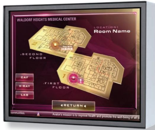
Screen image courtesy of X20 Media, Inc.

With passive image enhancement, you get 30 to 40% lower backlight energy consumption at equivalent readability. That reduced energy consumption gives you a similar reduction in cooling power. You gain both ways, and save on power costs every single day.